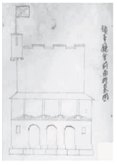
The front general sketch of Tamsui British Consulate (now Fort San Domingo); Volume 131, Number 11, "Official Document of Taiwan Sotokufu," Documents, in the 30<sup>th</sup> Year of Meiji Era (1897).