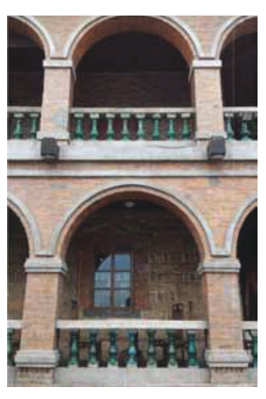
Details of the arcade of Tamsui Red Castle (taken by the researcher in October, 2015)