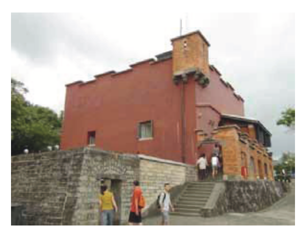
Current Status of Tamsui Fort San Domingo