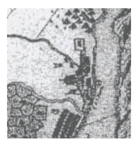
Fort San Domingo in the 17<sup>th</sup> Century.