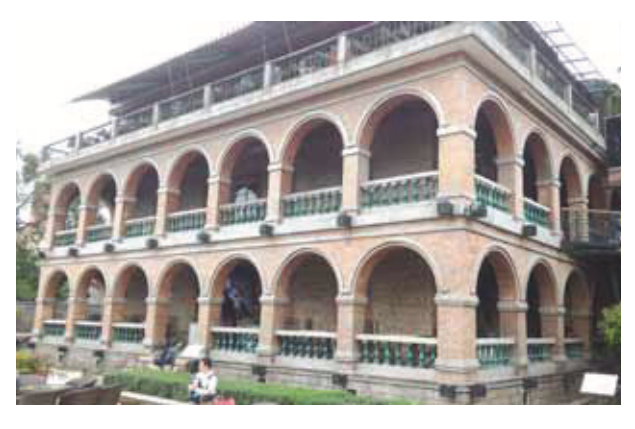
Tamsui Red Castle is used currently as a restaurant